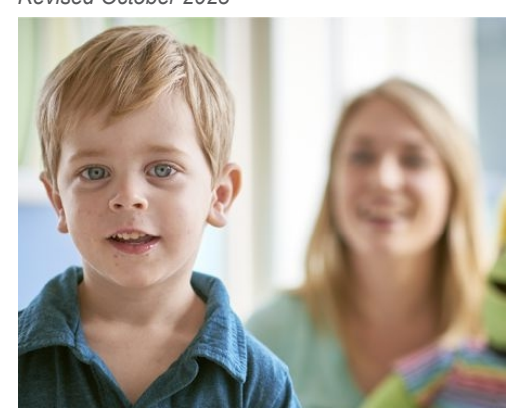
Revised October 2023

Questions about individual health concerns or specific treatment options should be discussed with your physician.